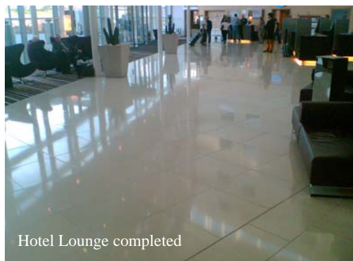
Hotel Lounge completed