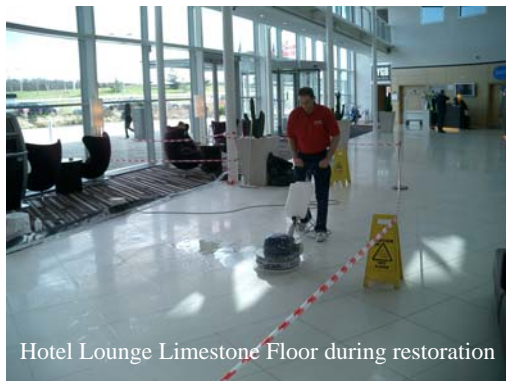
Hotel Lounge Limestone Floor during restoration