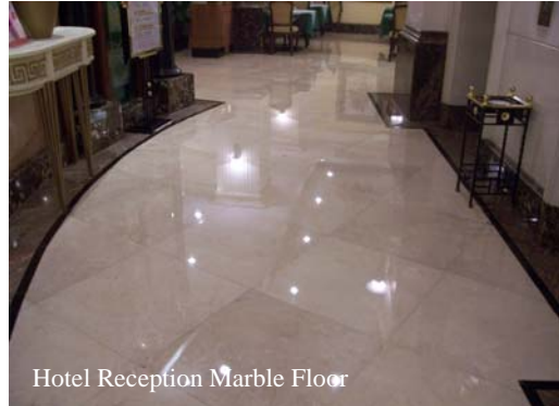
Hotel Reception Marble Floor