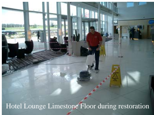
Hotel Lounge Limestone Floor during restoration