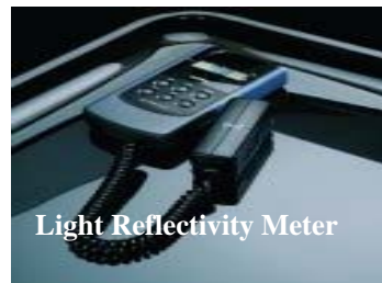
Light Reflectivity Meter