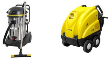
The Most powerful portable Hot Pressure Washer Machines for those with a smaller budget

Many of our competitors use outdated systems. At NU-LIFE we use state-of-the-art equipment . The machines we use are the most advanced systems available. Our equipment don't over-wet and give maximum soil removal.