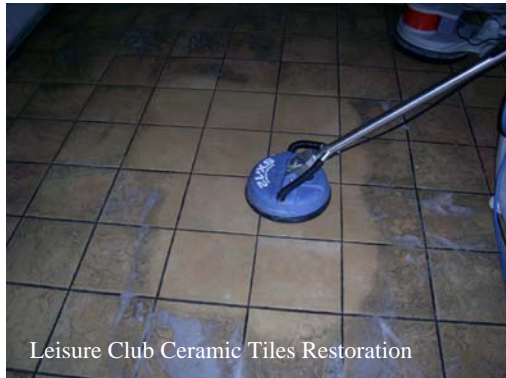
Leisure Club Ceramic Tiles Restoration