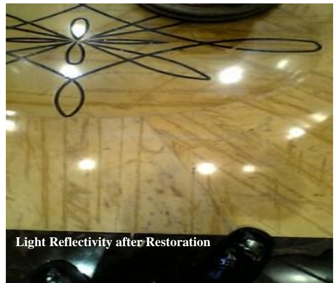
Light Reflectivity after Restoration

The very latest, innovative tools and equipment to ensure you and your clients are getting the best results possible